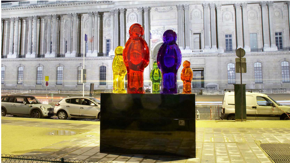
Jelly Baby Family, pigmented urethane resin on granite base, public installation outside the Louvre, Paris, 2010 Mauro Perucchetti

From the Magazine ( January–February 2015 )