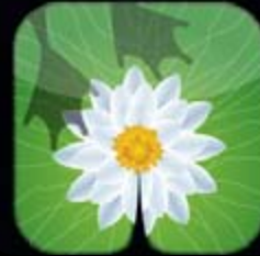
When Behind, Leapfrog