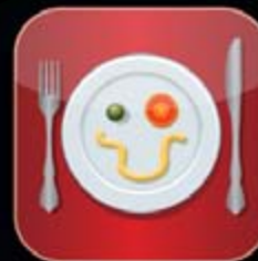
Stay Hungry, Stay Foolish