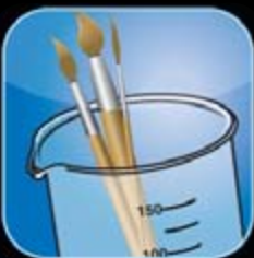
Combine the Humanities with The Sciences