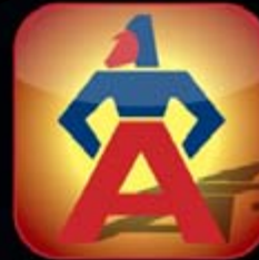
Tolerate Only "A" Players