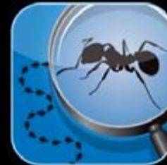
Know Both the Big Picture and The Details